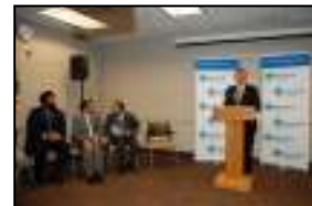
Premier Stelmach speaking at the opening of the East Calgary Health Centre

The programs and services offered at the East Calgary Health Centre also encourage and support lifestyles that help keep Albertans healthy, and are targeted to the health needs of their particular community. For example, the population of east Calgary has a higher percentage of low-birth weight babies. Therefore, the East Calgary Health Centre provides specialized public health, prenatal and postpartum community services to help address this issue, all in one location.